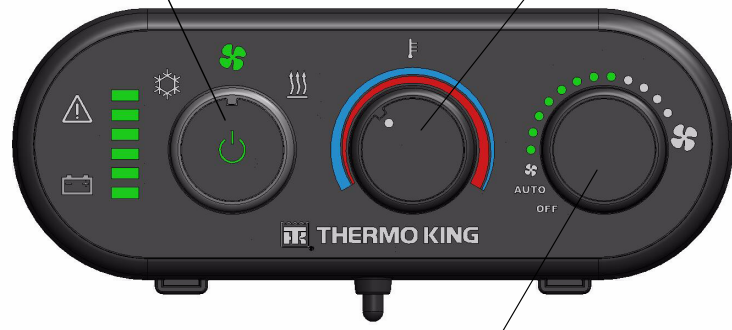
Fan Speed Selection