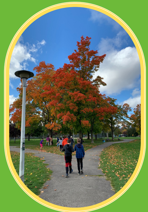
Outdoor space at Senior Campus

Grade 5 & 6 overnight trips to a nature-camp and a trip to a High School science fair complement community-based field trips.