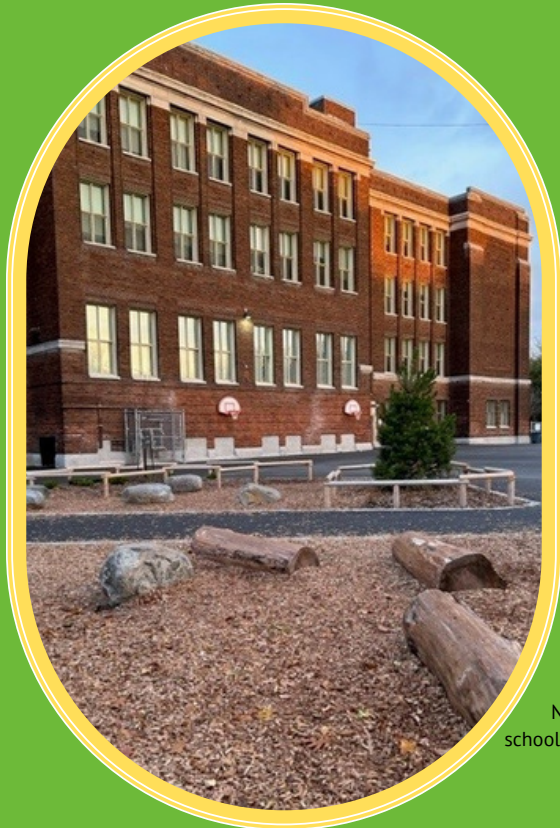
Newly renovated schoolyard at Junior Campus