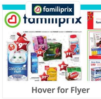
Hover for Flyer