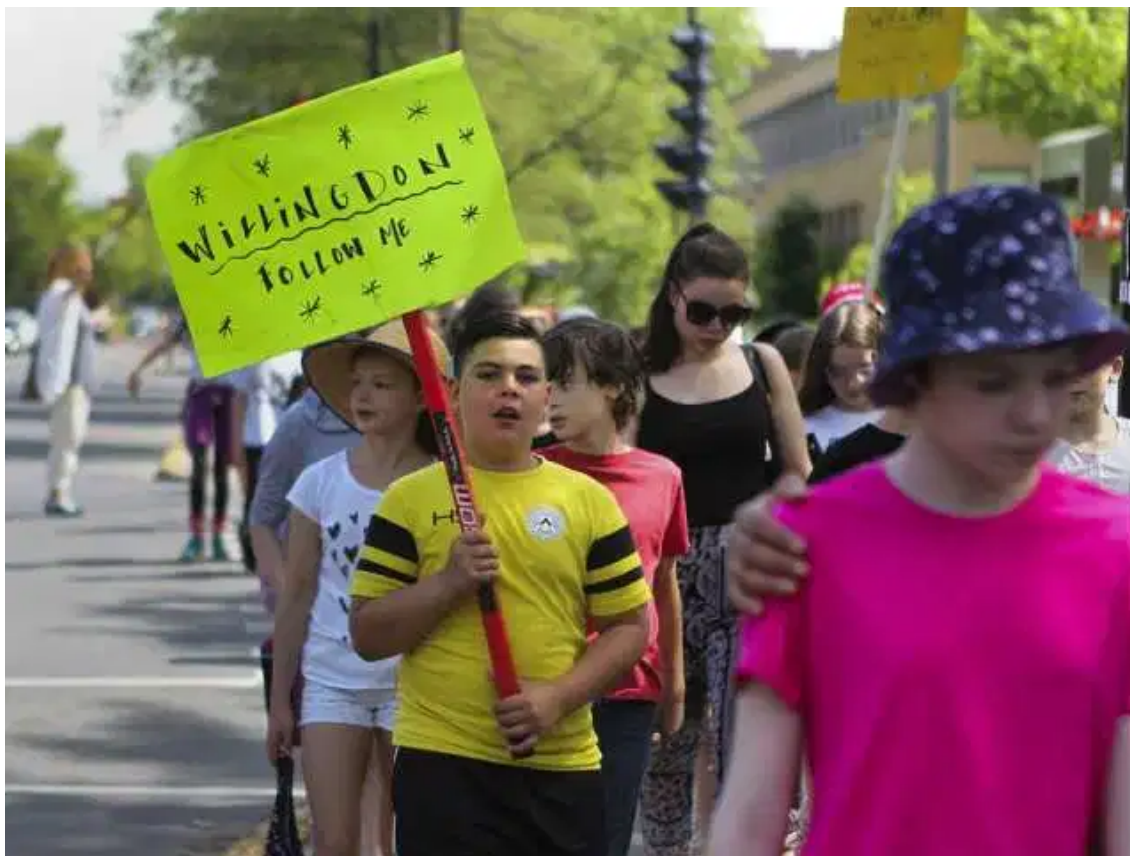
Grade 5 and 6 students from Willingdon Elementary School walk from their school with teachers and parents, to a senior campus about 2 kilometres away that is being prepared for them on Wednesday, June 19, 2019 as a solution to increased enrolment.