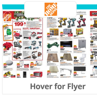
Hover for Flyer