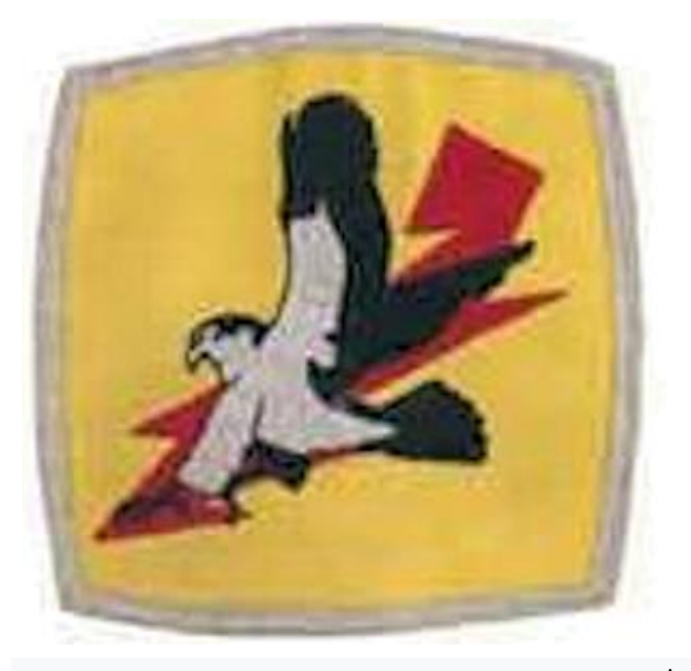
Emblem of the 337<sup>th</sup> Fighter-Interceptor squadron

The 337<sup>th</sup> Fighter Squadron was activated in 1942 in Iceland with the mission of destroying German planes that on occasion attempted to attack Iceland. The squadron returned to U.S. in Nov. 1942 and was assigned to train P-38 pilots in California and Washington State.