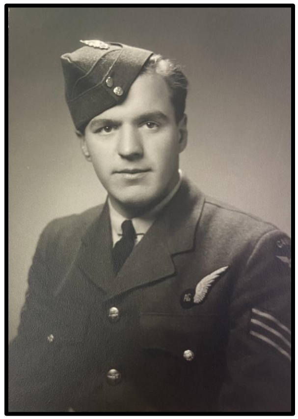
Rank: RCAF-Air Gunner