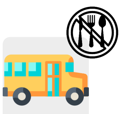
I DO <u>NOT</u> EAT on school buses