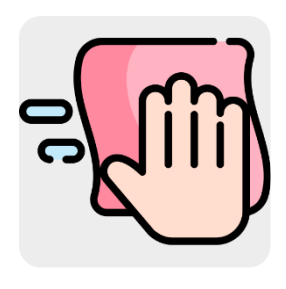
I CLEAN my eating surface after meals

surfaces, desks and place mats of students with allergies