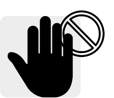
I DO NOT TOUCH eating

surfaces, desks and place mats of students with allergies