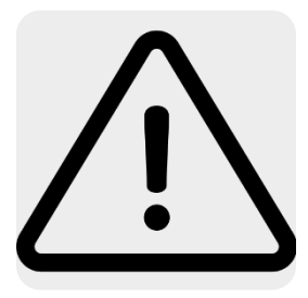
I AM CAREFUL if my lunch contains allergens (I avoid contact with students with allergies)