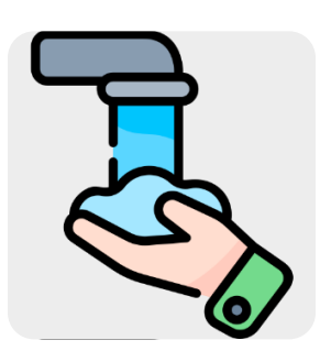
I WASH MY HANDS before and after eating

*An allergen-free environment cannot be guaranteed as complete avoidance of all allergens is not possible. Precautionary measures practiced by all has proven to be successful in preventing allergic reactions. As such, we ask all to be mindful and exercise these actions to ensure every effort is made to maintain an "allergy-safe" school.