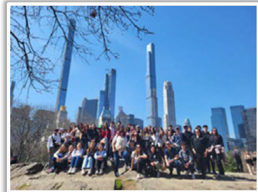
NYC TRIP – Sec. 5