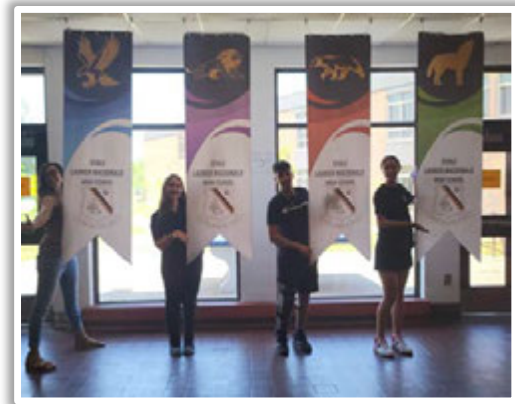
HOUSE SYSTEM LEADERS

June 9 th , the school held its final Activity Day at La Ronde, marking another great school year at LMAC. The students had a lot of fun enjoying rides and games and making lasting memories to talk about over their summer break.