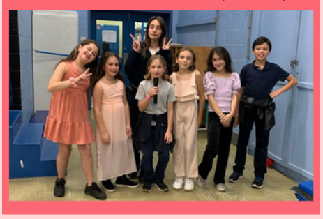
GMAA INCLUSIVE RACE (WINGS 1 AND 2)