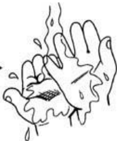
1. Wet hands