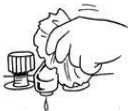
6. Turn off taps with towel