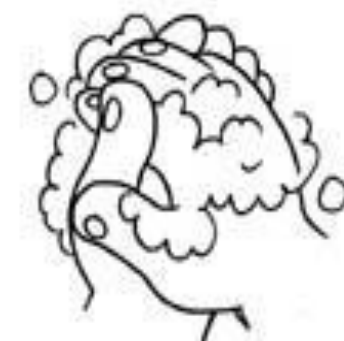
3. Scrub backs of hands, wrists, between fingers, under fingernails.