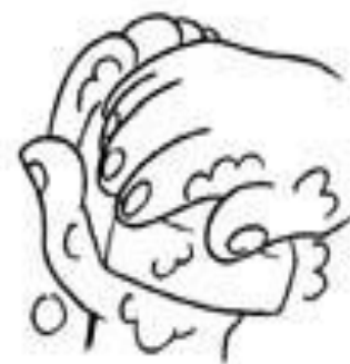
2. Soap (20 seconds)