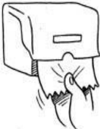
5. Towel dry