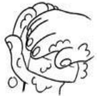
2. Soap (20 seconds)