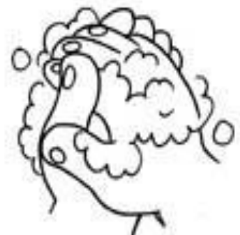
3. Scrub backs of hands, wrists, between fingers, under fingernails.