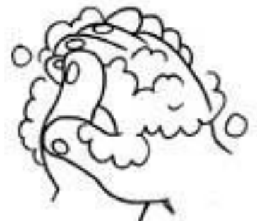
3. Scrub backs of hands, wrists, between fingers, under fingernails.