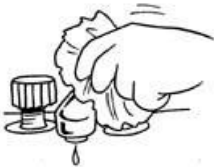
6. Turn off taps with towel