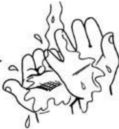
1. Wet hands