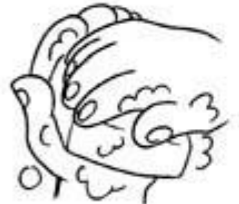
2. Soap (20 seconds)