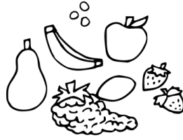
Things we eat