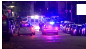
Morning news: Violent night in Montreal-North