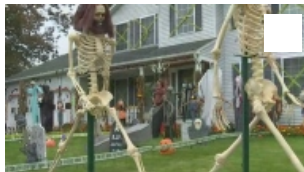
Halloween, inspired by The Beatles' Abbey Road