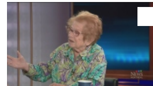
Ask Dr. Ruth: Sex, politics and abortion