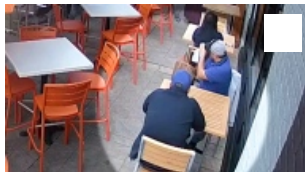
Video shows distraction theft on Markham patio