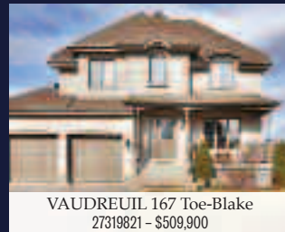
VAUDREUIL 167 Toe-Blake 27319821 - $509,900