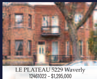
LE PLATEAU 5229 Waverly 12461022 - $1,295,000