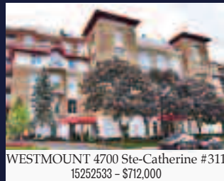
WESTMOUNT 4700 Ste-Catherine #311 15252533 - $712,000