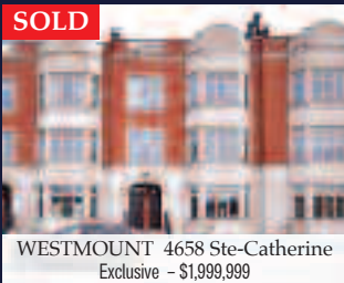
WESTMOUNT 4658 Ste-Catherine Exclusive - $1,999,999