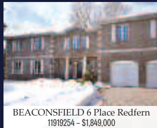
BEACONSFIELD 6 Place Redfern 11919254 - $1,849,000