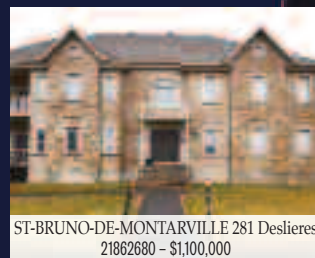
ST-BRUNO-DE-MONTARVILLE 281 Deslières 21862680 - $1,100,000