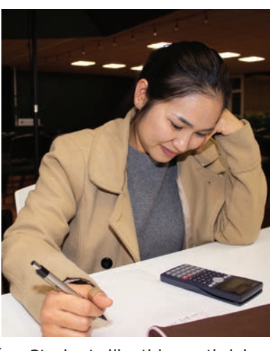
Students like this are thriving in mathematics at John F. Kennedy Adult Education

community that includes up to 600 students (both night and day) taking various levels of courses at the JFKAEC. Students shooting for a high school diploma are generally divided into three groups: immigrants, "nontraditional learners" and students who are "upskilling" (taking specific courses they need to get into a CEGEP). John F. Kennedy Adult Education Centre is located at 3030 Villeray. For more information, call 514-374-2888 or log on to https://jfkac.ca