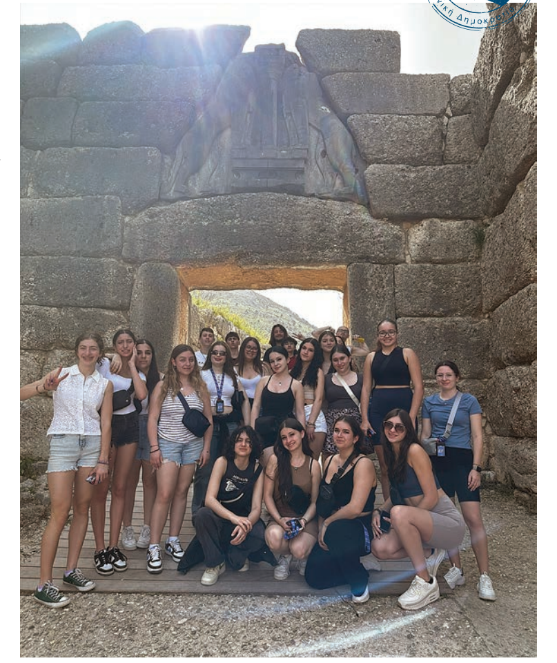
Pearson staff and students in Greece.

The next morning, some students woke up early to enjoy the sunrise by the sea before heading to the Epidaurus Theater. This ancient outdoor theater was followed by the fascinating archaeological sites of Mycenae. We had the opportunity to try authentic Greek desserts like baklava in the village of Vytina.