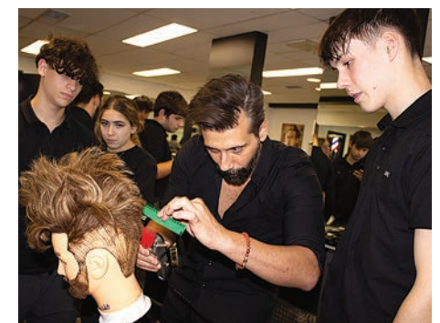
At LMAC Career Centre open houses, demonstrations like this one for hairdressing are very popular.

The Laurier Macdonald Career Centre in St. Leonard held its annual BBQ and Open House on May 22 at the des Grandes Prairies campus. It was a spectacular affairs with live music, lots of food, vintage model cars and a showcase of the auto mechanics, aesthetics and hairdressing programs. Folks lined up for free haircuts. There were also kiosks from other EMSB