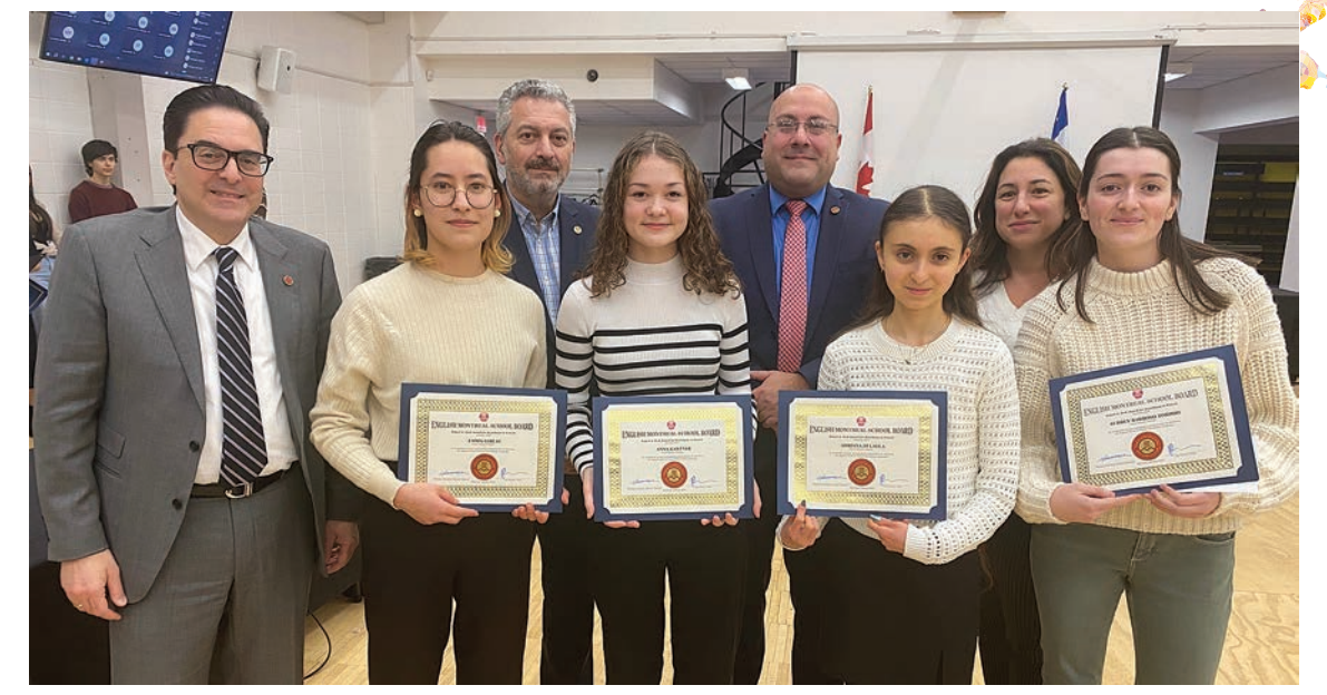
À l'heure actuelle, la cohorte de six ans de la CSEM affiche un taux de réussite notable de 94,8 %.

La Commission scolaire English-Montréal (CSEM) est heureuse d'annoncer que son taux de diplomation demeure le plus élevé de la province. Selon les plus récentes statistiques du ministère de l'Éducation du Québec pour l'année scolaire 2022-2023, le taux de diplomation de la commission scolaire s'établit à un niveau remarquable de 95,9 %, ce qui