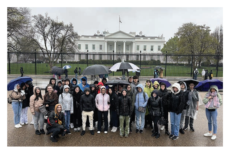
LMAC students near the White House.

High School trips to the United States and Europe occur towards the end of each academic year. In this edition we are happy to share with readers information on some of those travels.