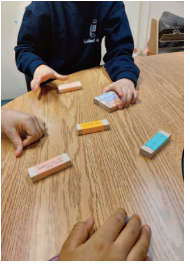
Two students work with Scratch and learn how code follows instructions and is read from top to bottom, as part of their independent study project.