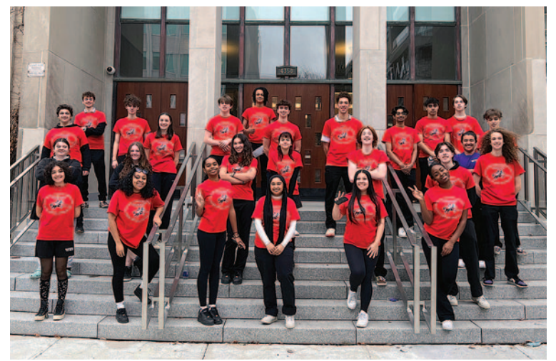
Westmount High School students get set to invite guests to learn more about their programs last year.