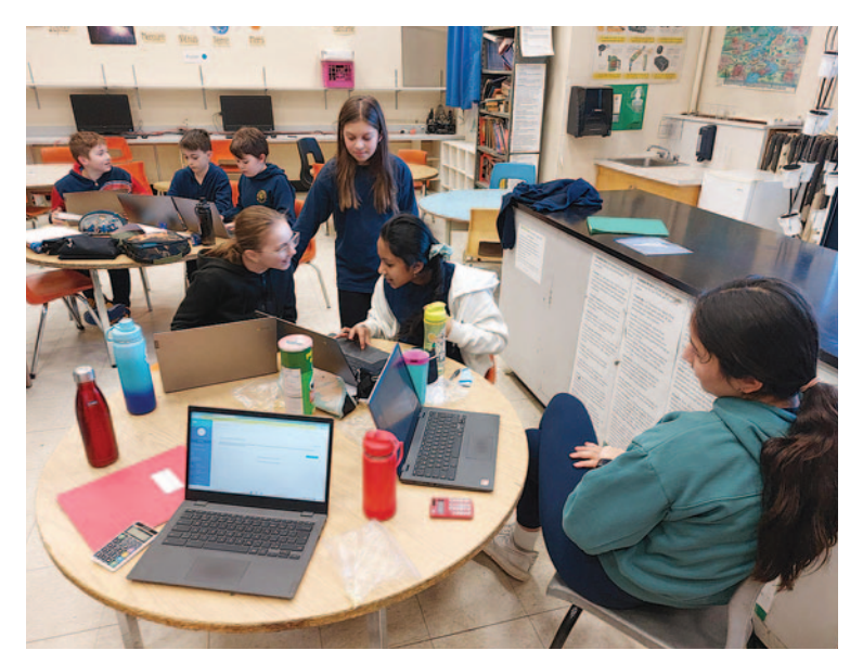
Roslyn Elementary School's Global Issues Problem Solving teams work hard at exploring global issues and real-life situations, while they creatively problem-solve.

competitions taking place earlier in the year.