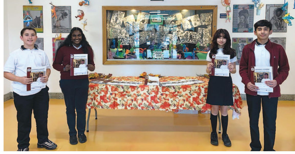
Students from LaurenHill Academy in St. Laurent at their open house last year.

Open House: Tours available by appointment. Please contact the school for more information.