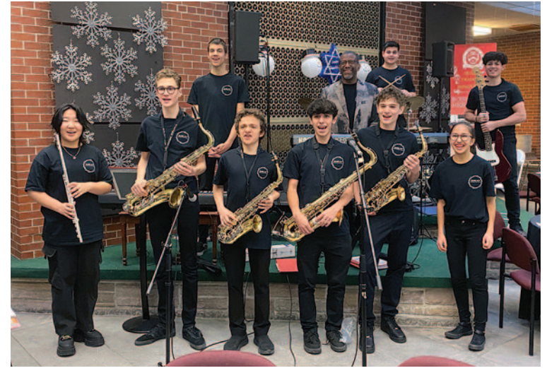
The music program will be showcased at the Rosemount High School open house.

canachieve success, cultivate a growth mindset and develop their unique potential. RHS stands out for its junior school model and its Universal Design for Learning approach. With a strong Resource department, students with special needs have access to remedial support. In addition to its regular academic curriculum, RHS also offers specialized music and