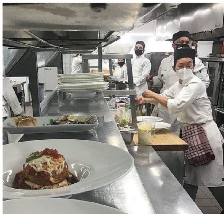
Action in the kitchen at St. Pius X.

Garofalo says she has her eye on the upscale Beatrice restaurant for her internship or any well-known Italian spot. After completing all 98 credits, which takes 13 months of daytime classes and includes an internship, students are equipped to work in a variety of food industries from restaurants