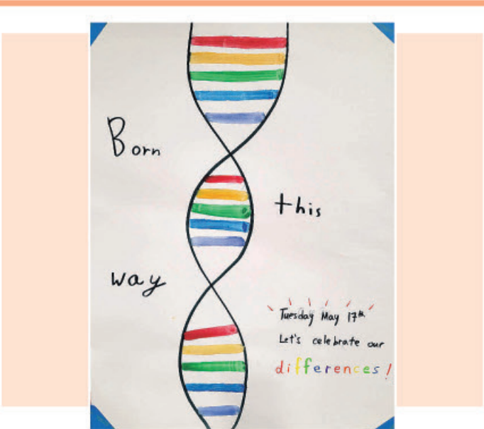
A drawing from one of the members of the Rainbow Club.