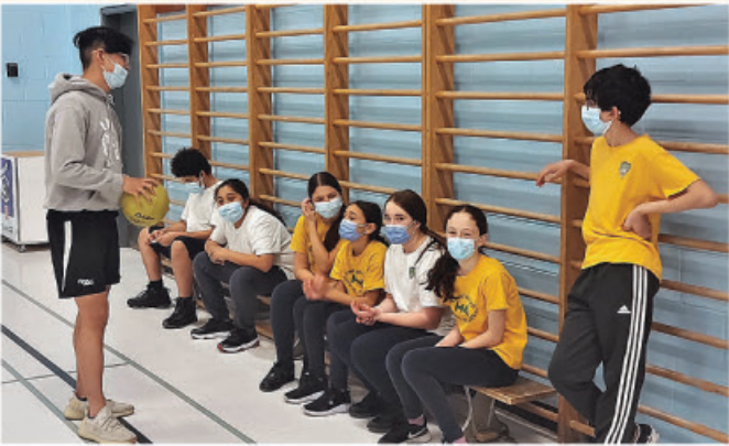
The leadership/mentoring program has been a big success.