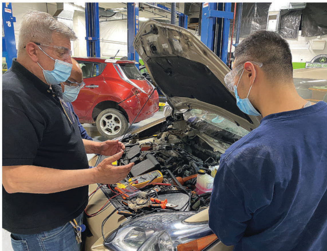
A teacher works with a student on an electric vehicle.

You can read a more detailed story on LMAC Career Centre at http://www.emsb.qc.ca/emsb/articles .