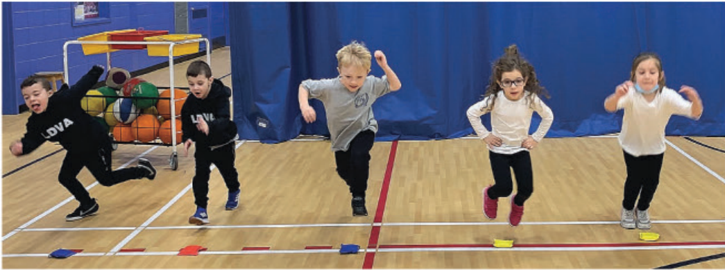
Leonardo Da Vinci Academy students sprint towards their championship.

LDVA B.A.S.E. Daycare won a BOKS Prize Pack from Catsports, valued at $400. All other six participating B.A.S.E. Daycares earned a BOKS Prize Pack of varying values donated by BOKS Canada. All top three performing B.A.S.E. Daycares (LDVA, Gerald McShane and Edinburgh) were paid a visit from Kim St-Pierre , a three-time Olympic gold medalist.