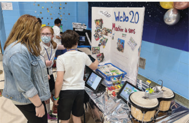
One of the interesting displays at the fair.

Students at Our Lady of Pompei Elementary School in Ahuntsic were been hard at work last year, honing their technology skills, and their exploits were on full display at their first ever Tech Fair. During the day, classes visited the fair to see the one-of-a-kind science, robotics and multimedia projects. Additionally, at night, for the first time in two years, parents visited the fair to see what their children had accomplished.