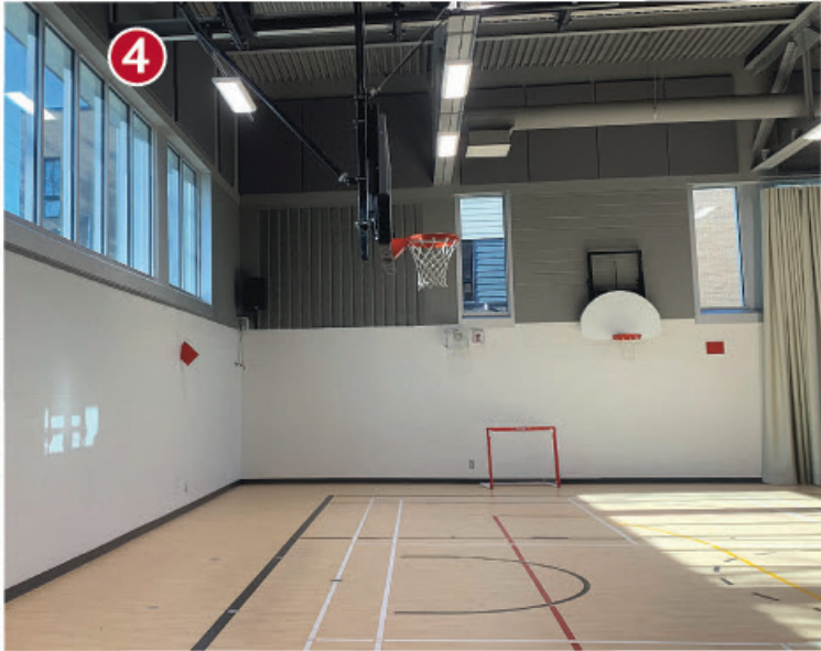
(1) EMSB and school officials, guests and students celebrate the launch. | (2) EMSB mascot Bumble works out with some students. | (3) The fitness room | (4) The new gymnasium

for a new gymnasium at Royal Vale and became the driving force behind the project.