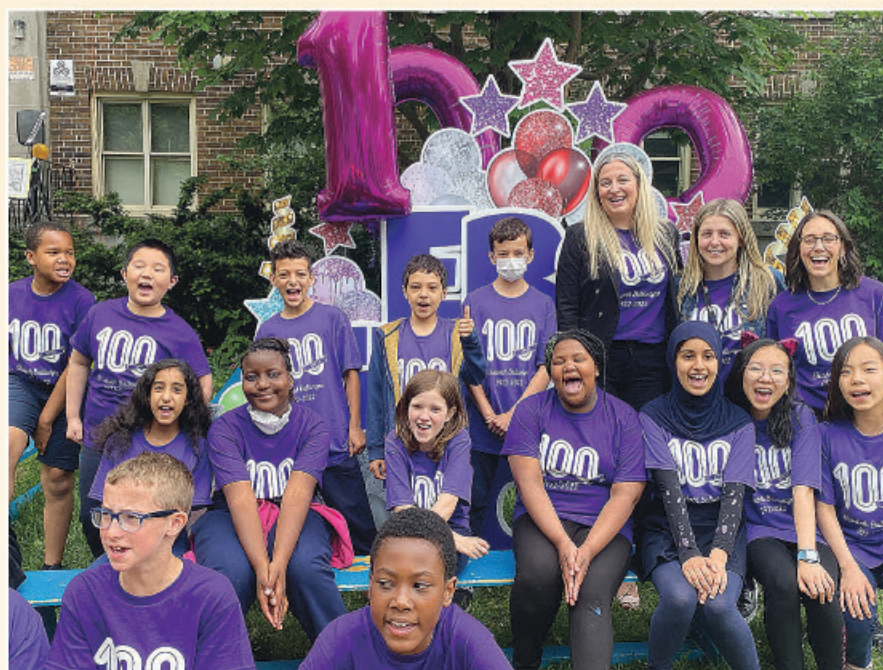
Students and staff celebrate the school's centennial.