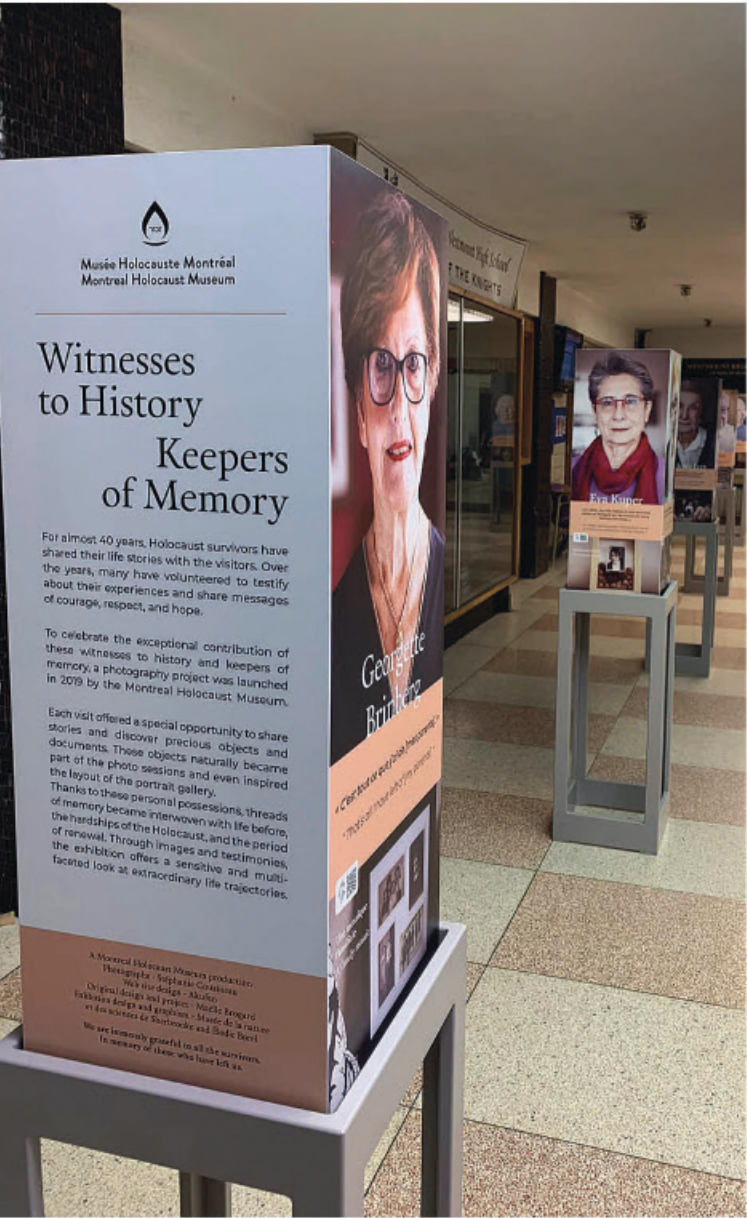
A Holocaust exhibit at Westmount High School.

The Azrieli Foundation’s Holocaust Survivor Memoirs Program has teamed up with the EMSB for its first board-wide partnership, and it has started bringing the topic of the Holocaust to classrooms across the city. The announcement of this novel partnership comes on the tails of principal and educator training sessions led by experts from the Holocaust Survivor Memoirs Program’s Education Team. During these sessions, principals learned about the program’s resources and how educators can safely and successfully teach students about the Holocaust using the Memoirs Program’s resources. After Yom HaShoah (Holocaust Remembrance Day, April 27, 2022), principals began distributing teaching materials to their staff, who then started teaching their students about the Holocaust. As a component of the partnership, the Memoirs team will be available to provide guidance and assistance, ensuring educators are supported as they navigate this space.