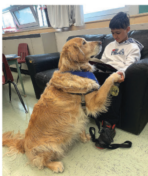
(left) Journey comforts students at St. Raphael.

Kira is now passing on her sensitization training to the next generation of service dogs with