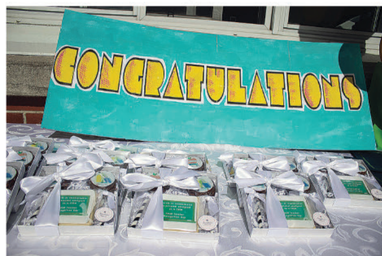
A display of gifts presented to the winners and guests.