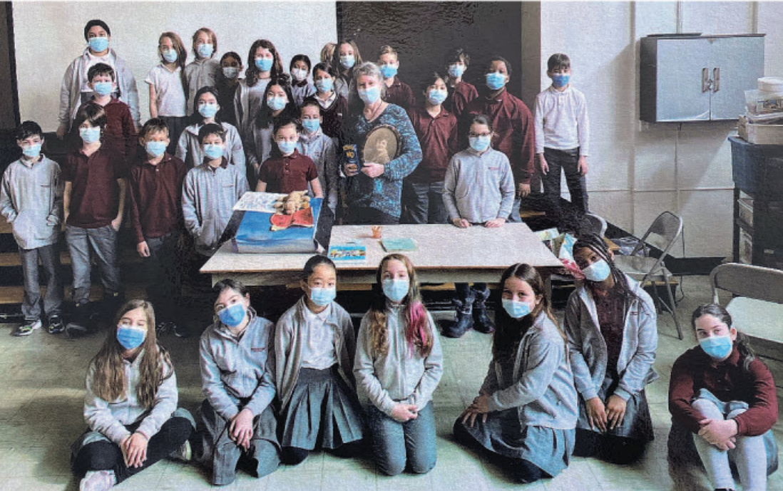
Les élèves de 4 e année de l'école Royal Vale sont partis à la découverte d'objets ayant été transmis de génération en génération.