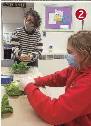
Volunteers from (clockwise): (1) East Hill Elementary | (2) Merton Elementary | (3) St. Gabriel Elementary