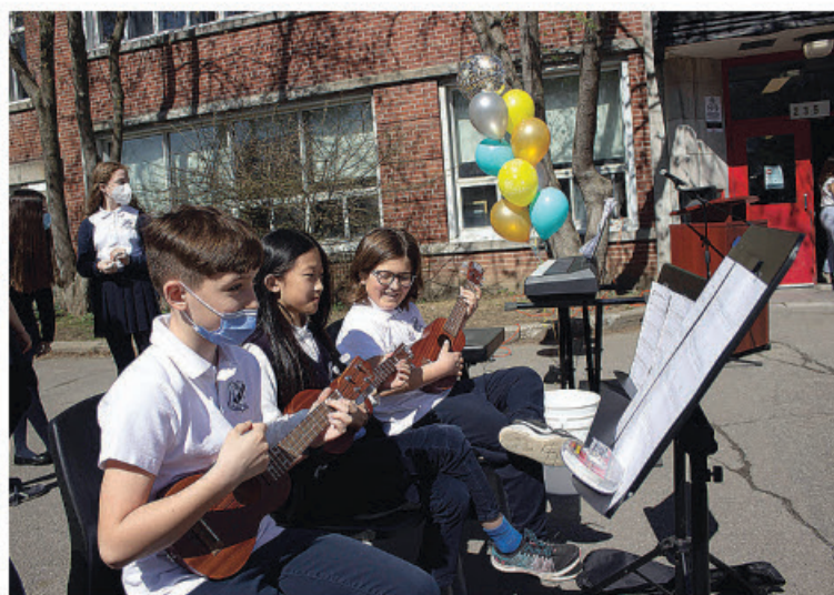
Dunrae Gardens students perform a musical interlude.

"I must share this honour with a big RTC team of administrators, teachers, and support staff, who in fact make my teaching so much more effective," he says.