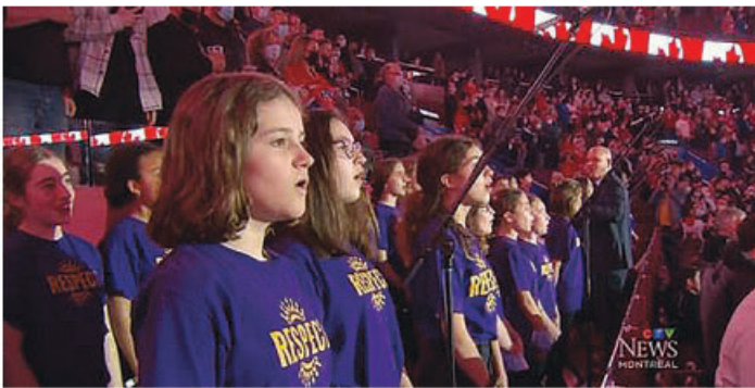
Willingdon students perform the national anthem.