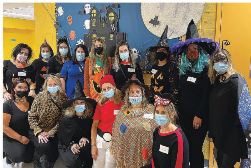
Volunteers from Leonardo Da Vinci Academy.