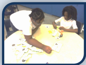
Students working on Accelerated Math activities