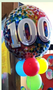
100 Days of School

QUOTE: May your day be touched by a bit of Irish luck, brightened by a song in your heart and warmed by the smiles of people you love. Irish Saying