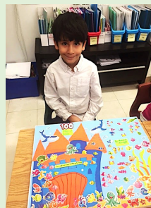
Students hard at work!